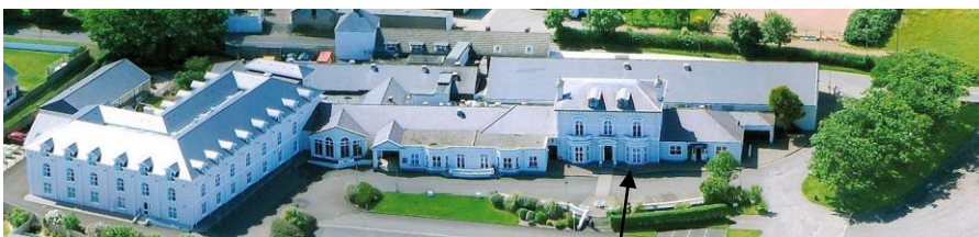
Room Location: Ground Floor, Magherabuoy House