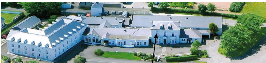
Room Location: First Floor, Magherabuoy House